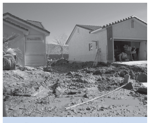
Flooded home in Mesquite, NV

The Nevada State Contractors Board (NSCB) Proactive Enforcement team visited the flood-ravaged areas of Mesquite, Overton, Bunkerville and Logandale. Investigators from the Board went into the communities to make contact with homeowners who suffered storm damage to inform them of their rights in contracting for repairs and the benefits of hiring only licensed contractors.