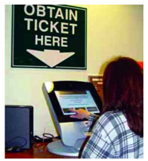
One of three Q-Matic ticketing kiosks in the Permit Center

The permitting process begins at any of three kiosks located at different areas within the Permit Center. Using touch screens, the customer chooses one of three options that detail the reason for the visit: commercial construction, residential construction or general permit questions. The next window displays additional selections to fur-