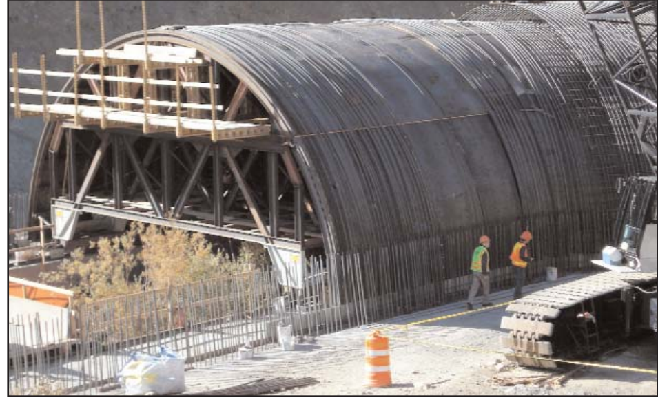
A temporary arch is constructed over Galena Creek, as part of NDOT's I-580 Extension from the Mount Rose Interchange to Bowers Mansion

that the flurry of projects is bringing a record amount of new space to the market, and some worry that a national recession could bring the activity to a screeching halt. Developers, however, say they continue to field a large number of requests for proposals from companies looking to locate new or expanded facilities in Northern Nevada.