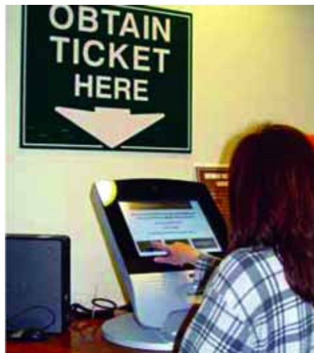
One of three Q-Matic ticketing kiosks in the Permit Center

The permitting process begins at any of three kiosks located at different areas within the Permit Center. Using touch screens, the customer chooses one of three options that detail the reason for the visit: commercial construction, residential construction or general permit questions. The next window displays additional selections to fur-