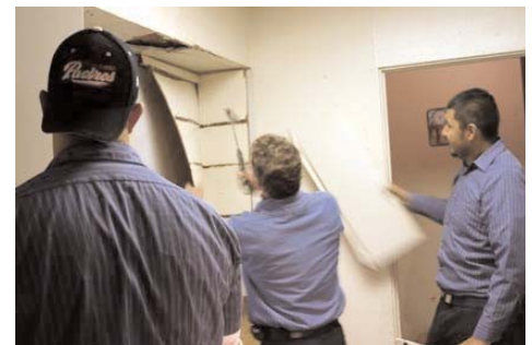
Volunteers tear out the old kitchen cabinets, left, and water-damaged ceiling plaster above the sink.

donated a dumpster; and A-1 mechanical donated their services.